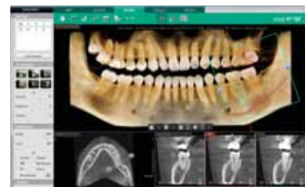
3D PAN tab