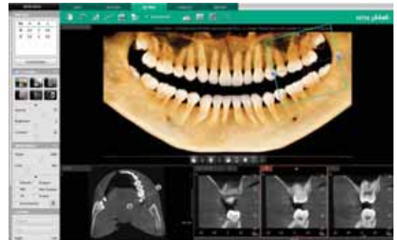
By clicking 3D Navigator and positioning to ROI, it's easy to verify 2D sectional images